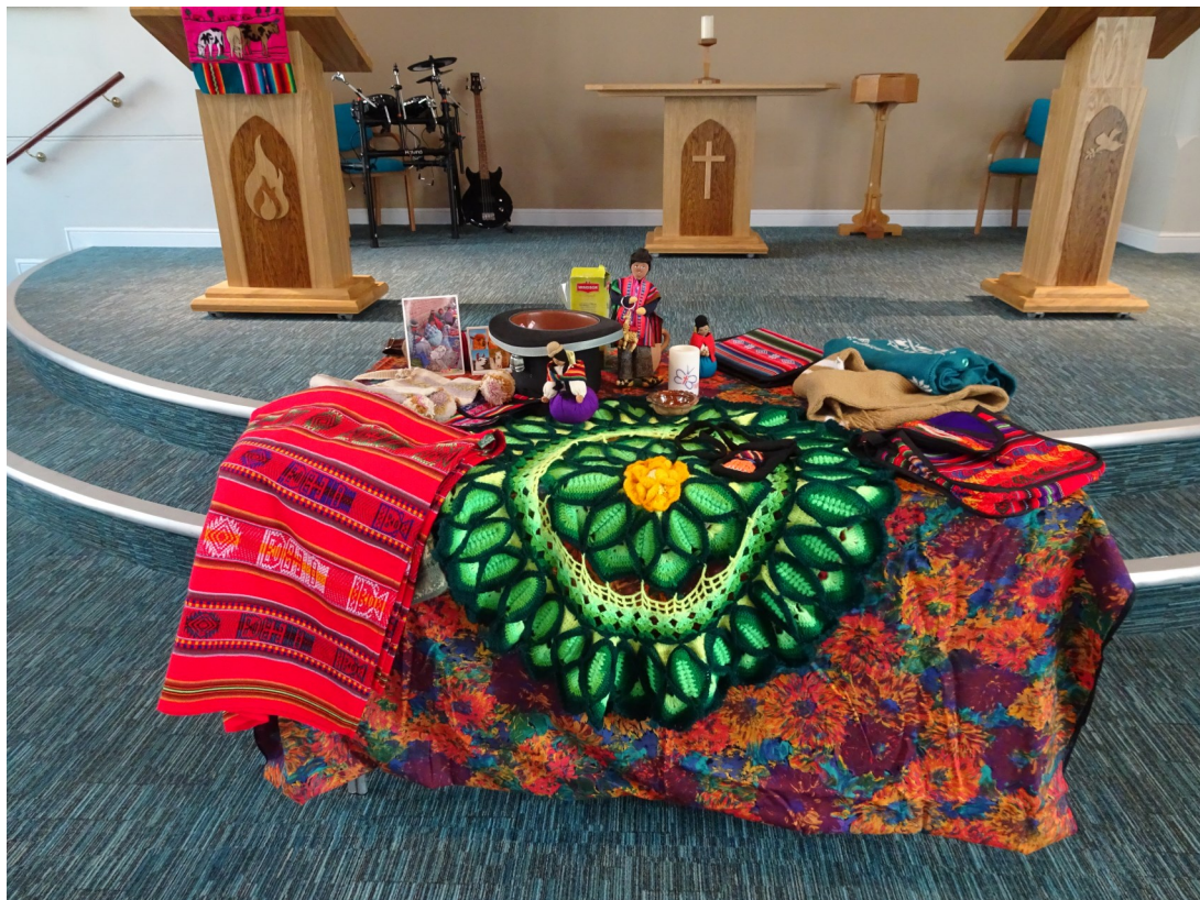
Sandra Goodwin's display at MWiB District Day at St Ives