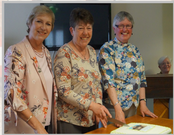
Celebrating 25 years of the Town Green Centre with the television presenter Pam Rhodes