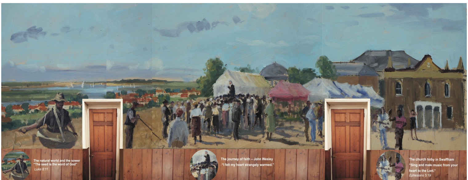
Artist's sketch of the mural commissioned for Swaffham Methodist Church