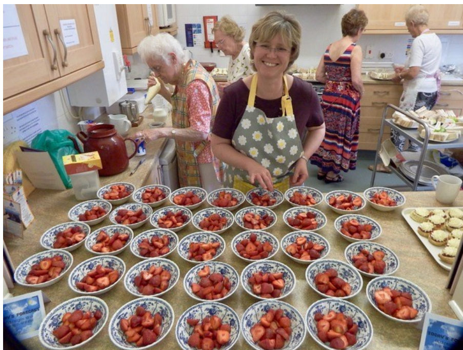
Bowled Over—strawberries for the Anniversary Tea at the beginning of July

Even as we prepare ourselves for a period of exile when the builders move in, we are challenging one another through Bible study and prayer to be a relevant and resourceful church that can play its part in reaching out with a message of welcome, hope and purpose, rooted in the Christian faith.