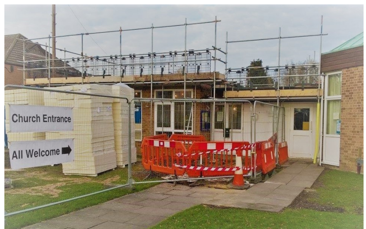
Renovation work in progress at Chesterton

bring to leadership and roles negotiated to meet individuals' strengths. Efforts were made to encourage all worshippers to be involved, including the children, from setting up the church for worship, within the service and in tidying up.