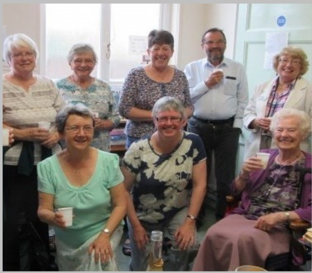
Celebrating the end of 25 years of a charity shop and transition to the new Green Room

have done the course (or dipped into it) in our 'Green Room' which is set up specifically for Mindfulness and Meditation.