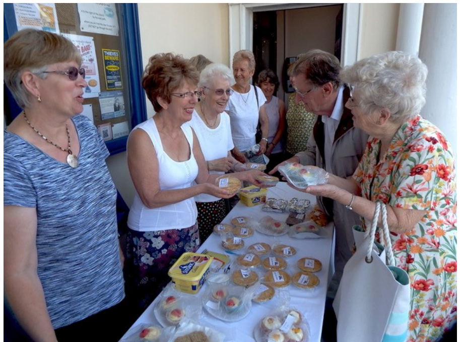
Big Bake—one of the fundraisers for the Pinnacle Appeal which raised over £500 in sales of savoury goods cooked by members of the congregation.

As part of a revitalised interior with space to grow as a congregation within the wider community, we have imagined a new welcome area in the church alongside a servery for refreshments.