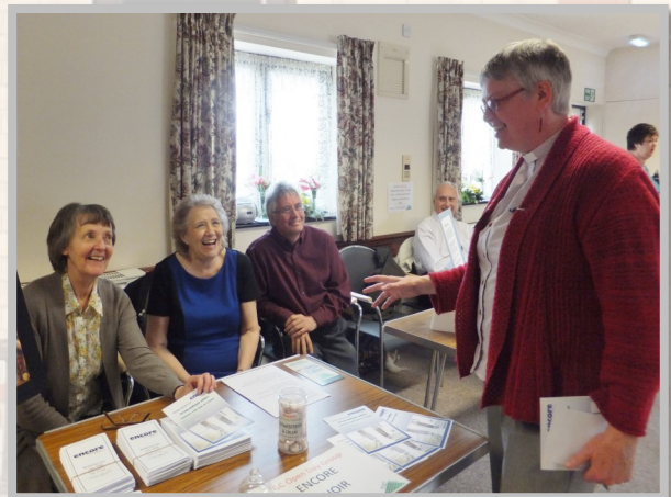
A stall at an Open Day at the Town Green Centre

of all activities in the Centre and through annual Open Days that showcase the 25 plus user groups. The latter aim is being realised through occasional events, workshops and other activities that enable those who do not want to come to church to access tools for personal growth and spirituality.