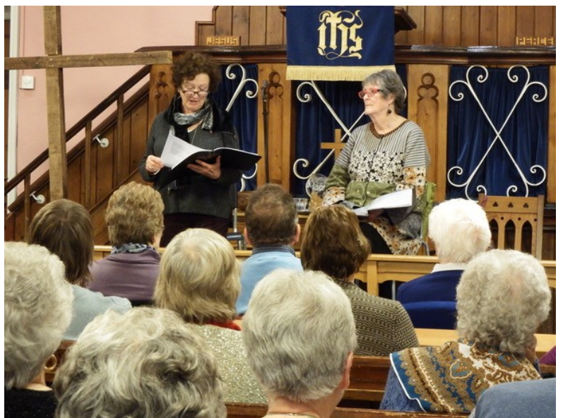
3s Company—a fundraising evening of poetry and readings held in the church